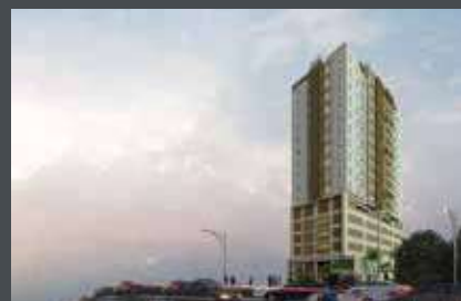
Country Naval View