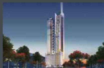
Country Finance Tower